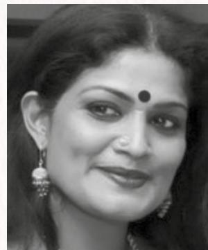
Padma Shri Ms Geeta Chandran Bharatnatyam Expert