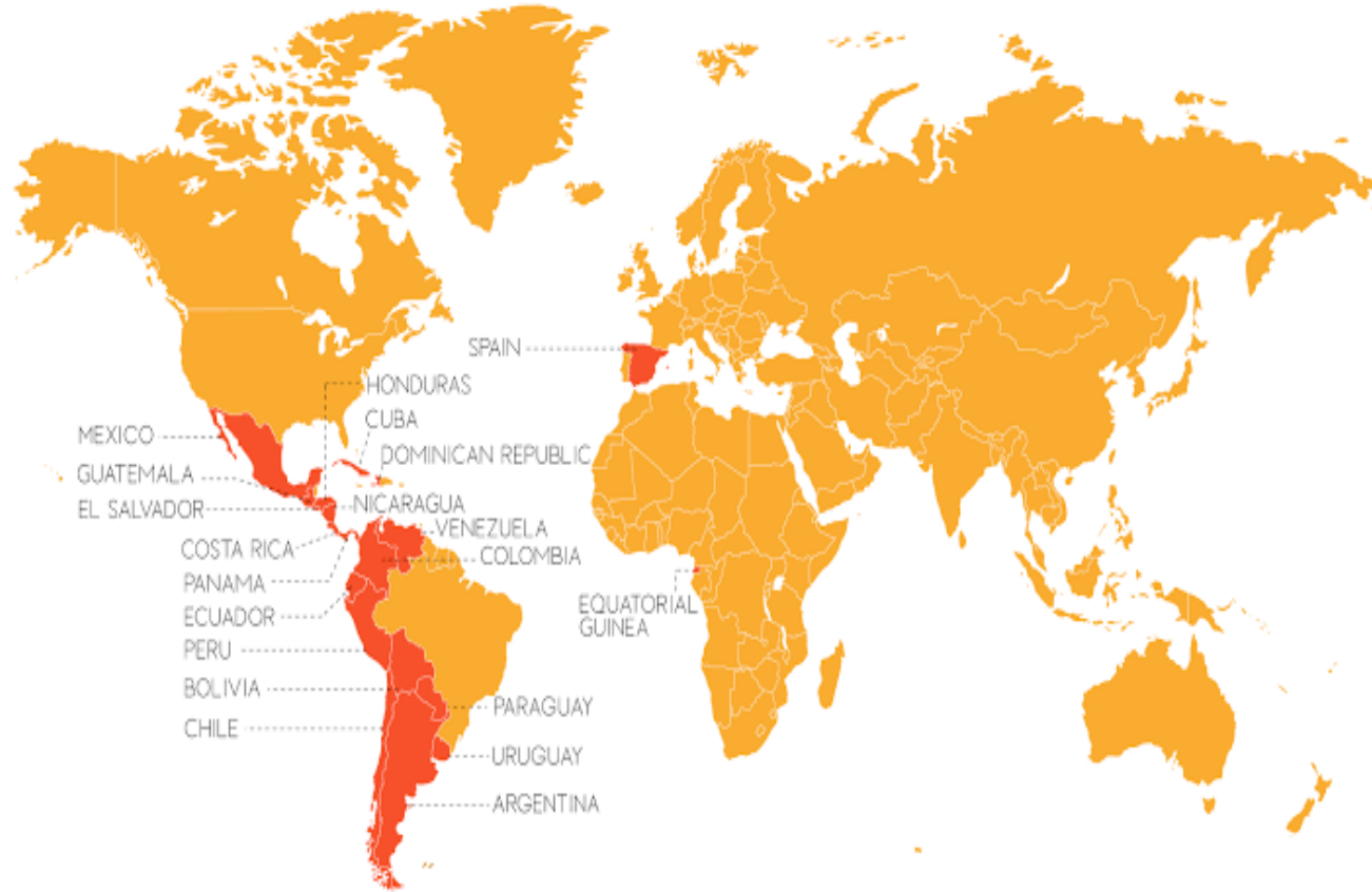
COUNTRIES WHERE SPANISH IS THE OFFICIAL OR NATIONAL LANGUAGE