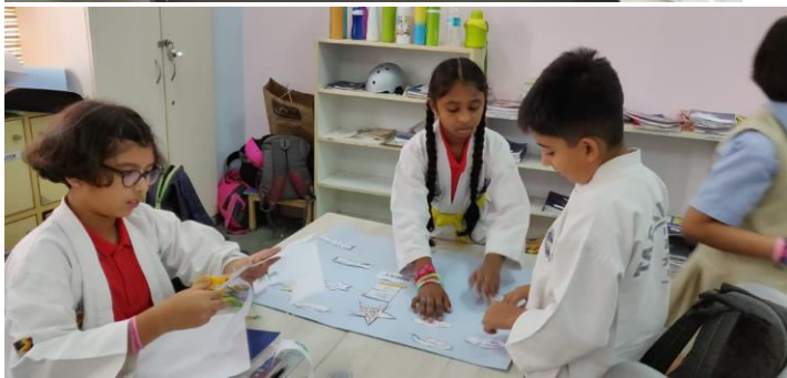
Grades VII to VIII- Inter House Virasat Quiz